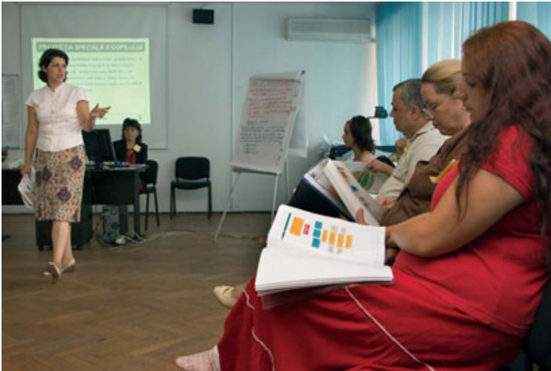
Training programme for professional groups, 2005

Putting these rights into practice and ensuring that all Romanian children benefit will be a long and challenging process.