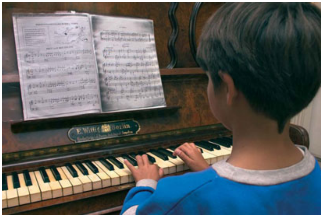
Girl taking piano lessons in a family type unit in a village near Cluj-Napoca