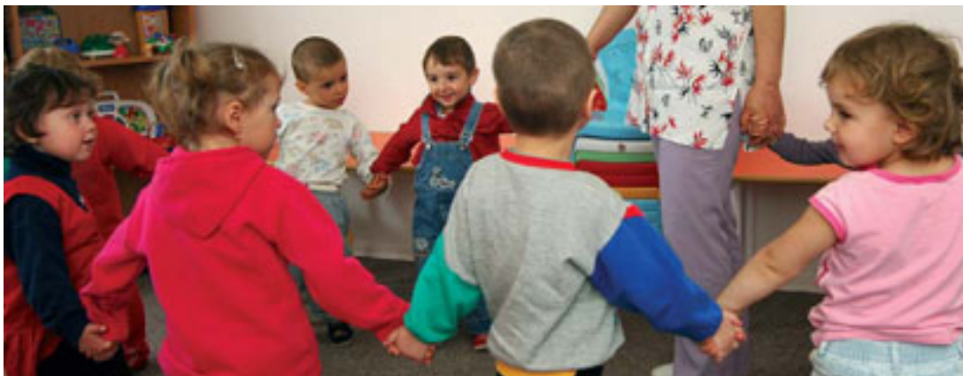
Children in day care centre, Iasi