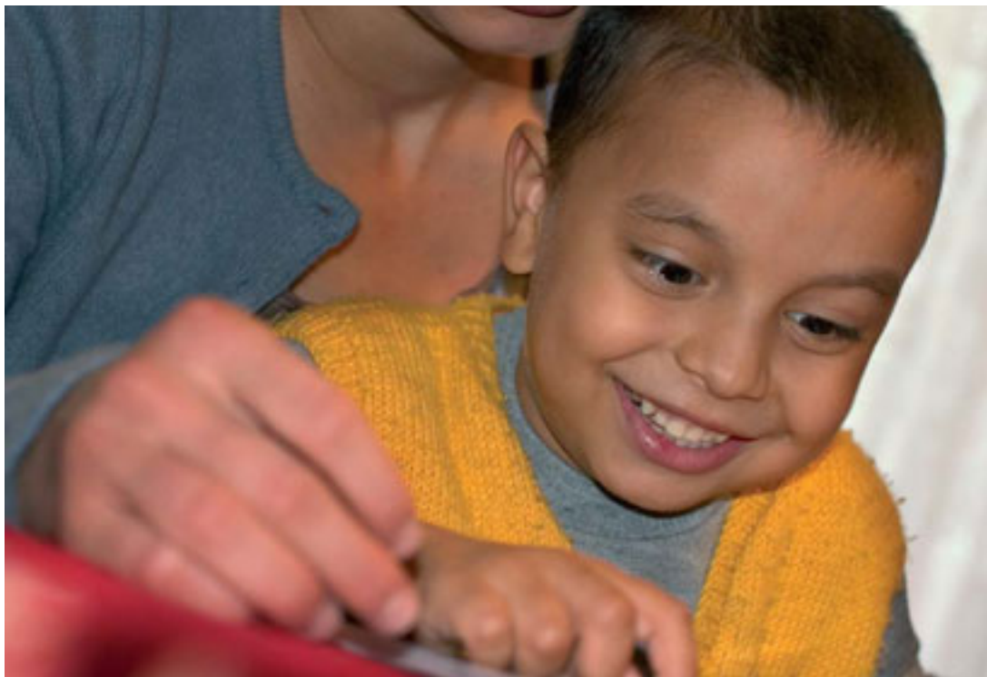
Boy in maternal assistance

The infant mortality rate (an infant being a child under 1 year old) has been in decline during this period. In 1989 the infant mortality rate was 26.9 per thousand and in 2003 the rate had decreased to 16.7. Source: UNICEF, 2005